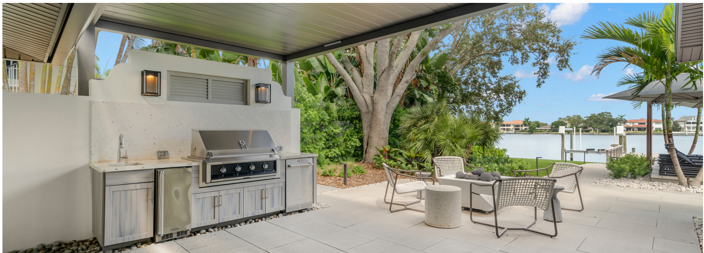
The outdoor kitchen has a motorized pergola to use rain or shine. Continued next page