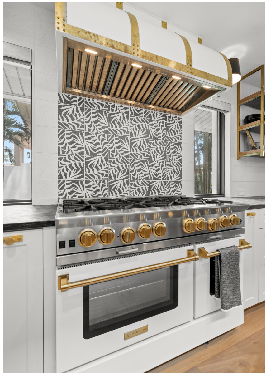
A gourmet kitchen is complete with custom cabinets and the latest design trends.

Review the portfolios of each contractor to be sure they have experience delivering on the type of project and quality of work you are expecting. Inquire about the contractor's project management process to address their plan for collaboration between you, the designer, and construction manager. A company with a strong project management process will be better equipped to provide you with quality work at a comfortable pace for you.